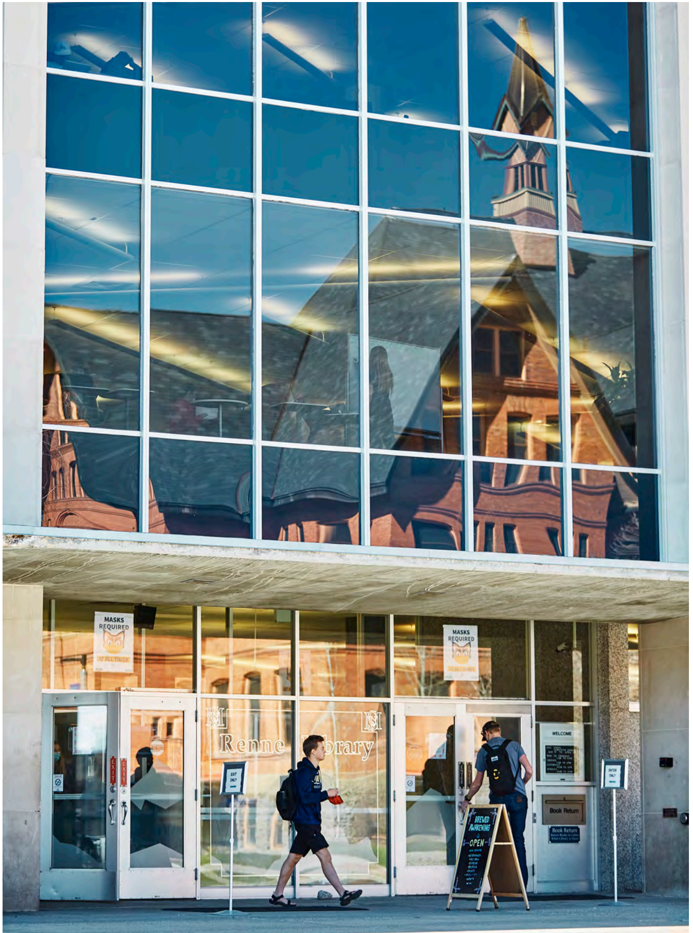
Montana Hall is reflected in the windows of the library