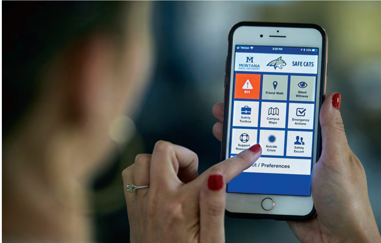
The SafeCats Safety App has been updated to include COVID safety information

SafeCats is a safety app that allows the user to contact police, request a safety escort, or to activate a Friend Walk in a single mobile application. The SafeCats app is available for both Android and Apple cellular phones and is available free of charge.