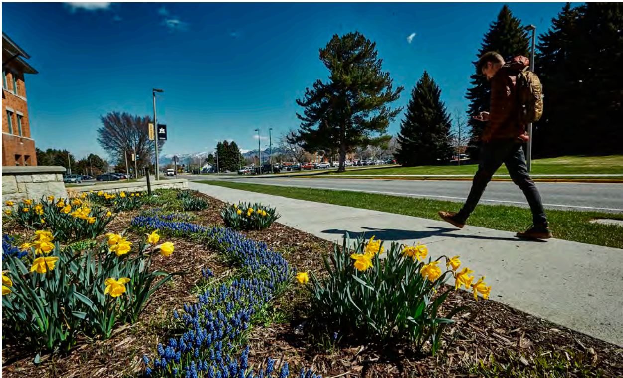
Flowers bloom on MSU's campus in spring 2021

Except as provided in 50-32-609 or Title 50, chapter 46, it is unlawful for a person to use or to possess with intent to use drug paraphernalia to plant, propagate, cultivate, grow, harvest, manufacture, compound, convert, produce, process, prepare, test, analyze, pack, repack, store, contain, conceal, inject, ingest, inhale, or otherwise introduce into the human body a dangerous drug. A person who violates this section is guilty of a misdemeanor and upon conviction shall be imprisoned in the county jail for not more than 6 months, fined an amount of not more than $500, or both. A person convicted of a first violation of this section is presumed to be entitled to a deferred imposition of sentence of imprisonment.