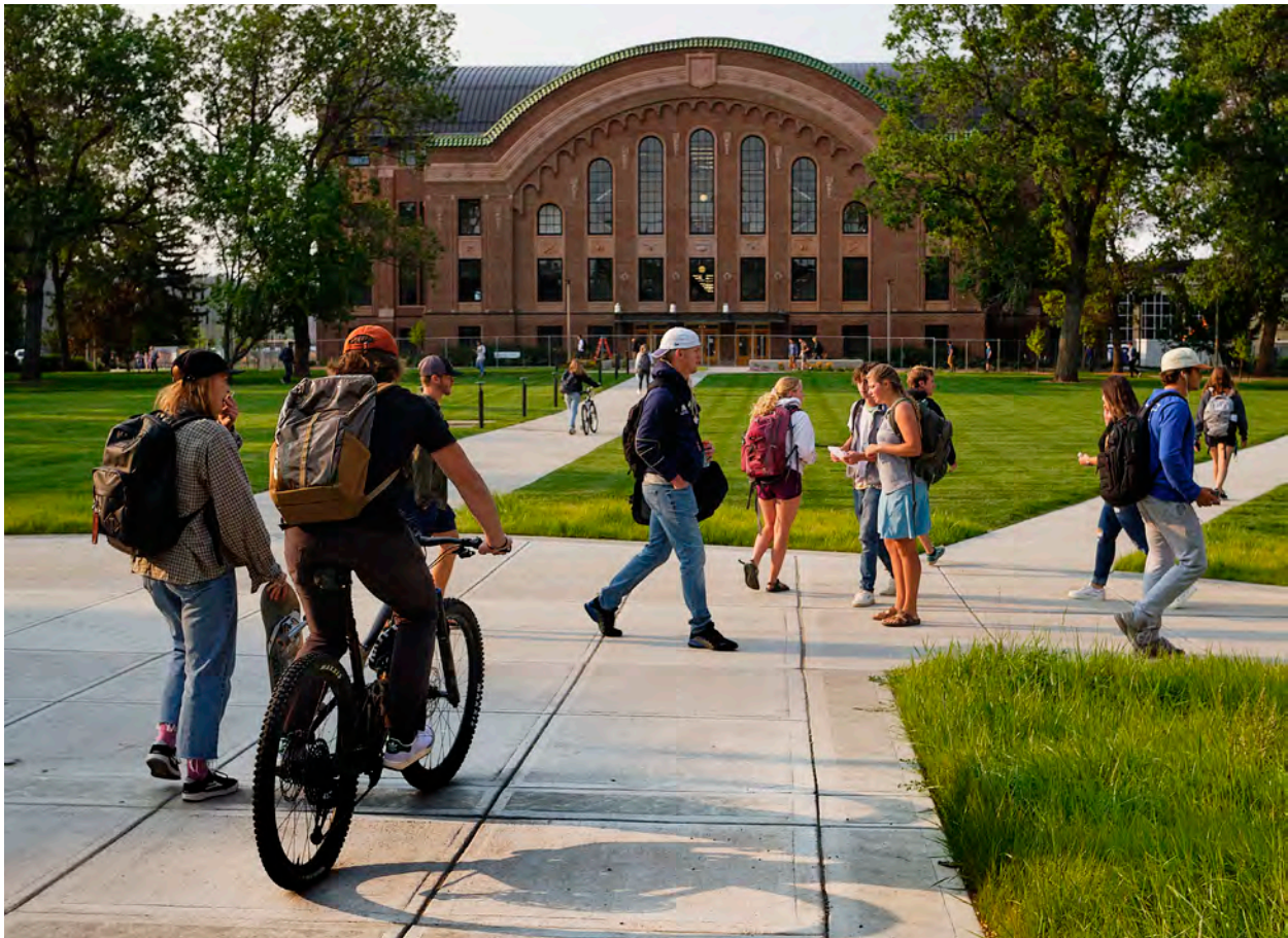
Romney Hall has been undergoing extensive renovations and will reopen in November 2021

Most officers hold a B.A. degree or are working towards a degree. The University combined its dispatch with the local County dispatch to provide more efficient and effective services. All County Dispatchers are trained and certified by the State of Montana. The Director is the University Police Chief and is responsible for the management of the UPD and reports directly to the Vice President of Finance and Administration. However, all public safety services are closely coordinated with other key university administrators as well as local officials.