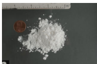
Cocaine

White, crystalline powder derived from coca leaves. Cocaine base (crack) looks like small, irregularly shaped white rocks.