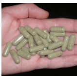
Kratom

Kratom is a tropical tree native to Southeast Asia. Consumption of its leaves produces both stimulant effects (in low doses) and sedative effects (in high doses), and can lead to psychotic symptoms, and psychological and physiological dependence.