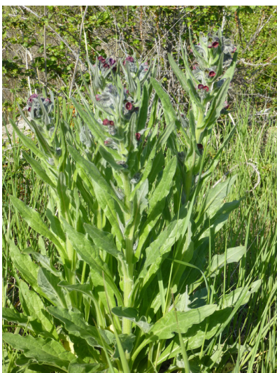
Figure 2. Flowering houndstongue plant.

Houndstongue readily displaces desirable species, can establish monocultures, and degrades forage quality and grazing capacity. Nutlets entangled in the wool or hair of livestock may create marketing problems for ranchers because of the extra time and money required to remove burs. They can also become lodged in the eyelashes of livestock causing potentially severe eye damage. Another concern is the threat of livestock poisoning from houndstongue (see Houndstongue Poisoning in Livestock). Although in most cases the fresh plant is considered unpalatable and is generally avoided, livestock may eat plants when they are cut and dried with harvested hay, or when animals are confined to a small area lacking desirable forage. Herbicides may also increase palatability of houndstongue foliage.