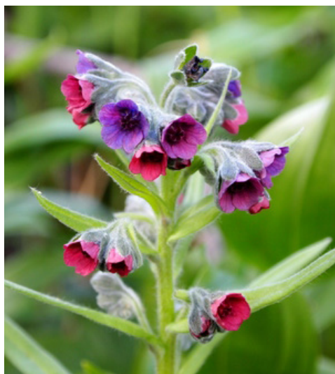
Figure 3. Houndstongue flowers.