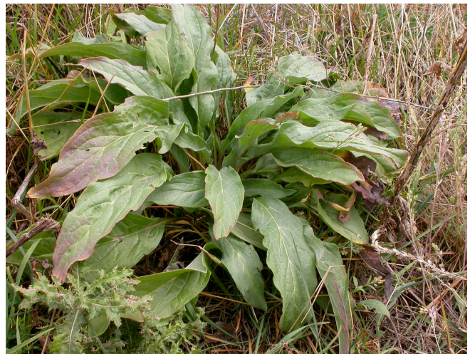
Figure 1. Houndstongue rosette with oblong leaves with prominent veins.