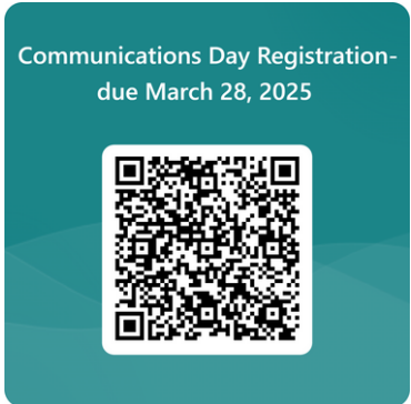
Communications Day Registration- due March 28, 2025

This competition is open to all 4-H members from Cloverbuds to Seniors. 4-Hers 13 and up who win a blue ribbon will be eligible to compete at state Congress in July. For those 14 and up, Congress winners will be eligible to attend National 4-H Congress as a member of the Montana Delegation.