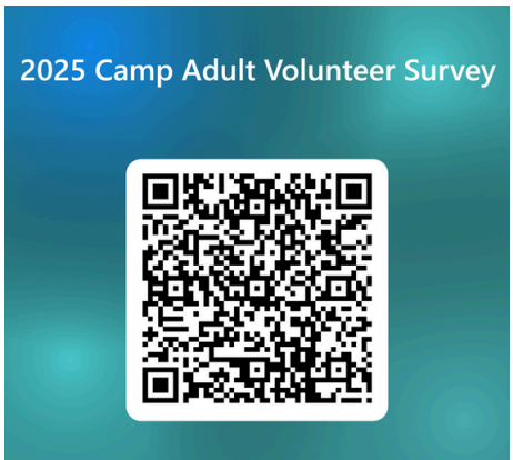
2025 Camp Adult Volunteer Survey

Let us know how you can assist by completing the survey.