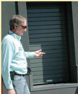
Shipping access considered to maximize energy efficiency

Energy efficiency initiatives extend far beyond the building envelope and began even before the move.