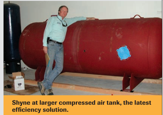
Shyne at larger compressed air tank, the latest efficiency solution.

Since a move had been imminent at the time of the energy analysis, no changes to an aging air delivery header were recommended, but the compressed air system in today’s facility has a robust air delivery header appropriate for the current and anticipated air requirements recommended in the report.