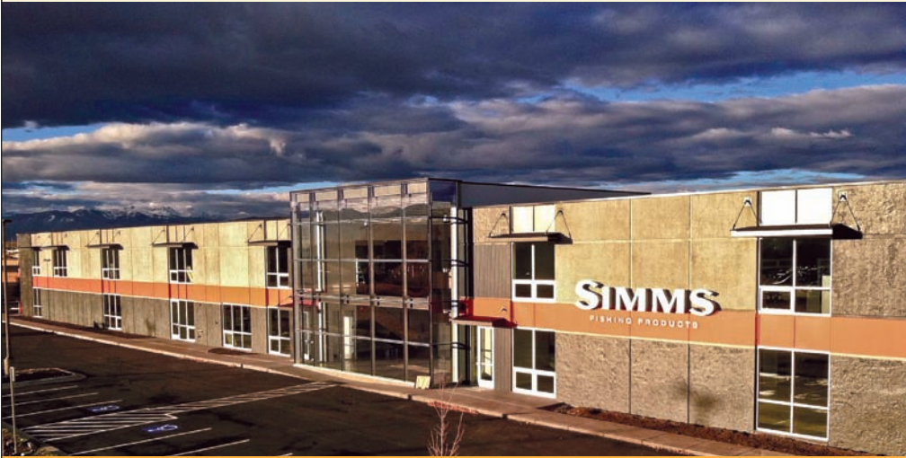
Showcase for energy efficiency, the SIMMS brand, and a model workplace.

considerable Experts came on site to collaborate with the building contractor, Simms staff, and the MMEC engineer.