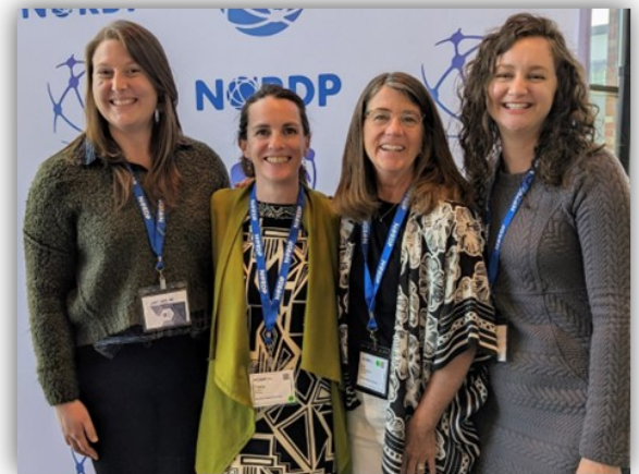
Our team at the NORDP meeting Bellevue, WA, April 2024.